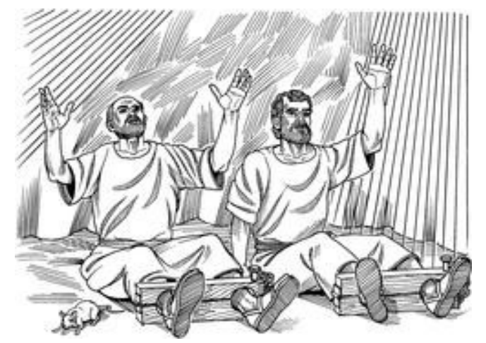
Paul and Silas in Philippian Prison (Acts 16)

"BIBLICAL JOY" – The settled conviction that God sovereignly controls the events of life for the believer's good and God's glory.