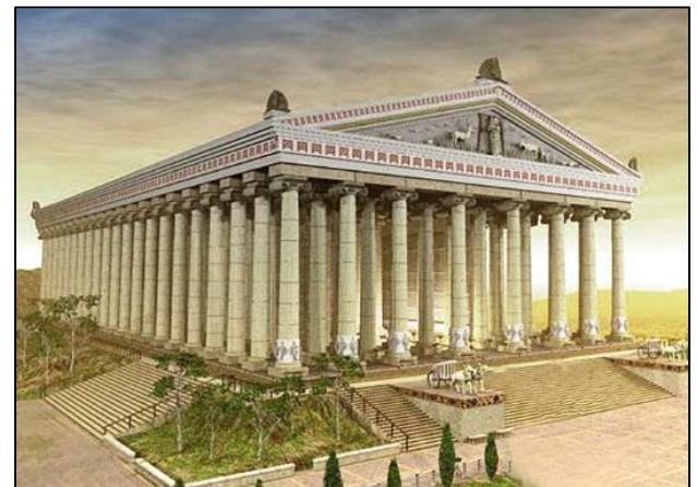
Temple of Artemis in Ephesus

How are we attacking the work of satan in our world?