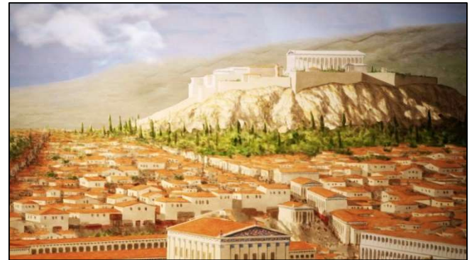
Athens in the days of Paul

Reflection: Each piece of marble was cut uniquely to fit together once placed on site of the Parthenon. They did this perfectly so the gods would be pleased. It held together completely until there was a bombing. They tried to put the pieces back together, but it began to deteriorate. 1 Corinthians 12:12 and 27 says that every person is special and collectively we are the body of Christ. We are the temple of Holy Spirit (1 Corinthians 6:18-20). We are built to please God. We each have our place